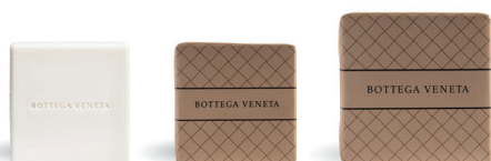
HAND WRAPPED SOAP Eau Légère

50 ml / 1,69 fl. oz 100 ml / 3,38 fl. oz