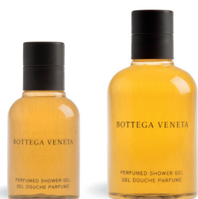
SHOWER GEL Eau Légère

Bottega Veneta, the fragrance, is inspired by a vision of the Venetian countryside. In this dream, the supple sensuality of the house's renowned leather goods is suffused with warmth, sunshine, and a summer breeze redolent of hay, earth, forest, and flowers. An elegant and unexpected balance of nature and art, it is a fragrance that lingers in the mind like the memory of an unforgettable woman. Now Bottega Veneta introduces a new and unique interpretation of this enchanting idea - Bottega Veneta Eau Légère.