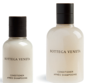
CONDITIONER Eau Légère

50 ml / 1,69 fl. oz 100 ml / 3,38 fl. oz